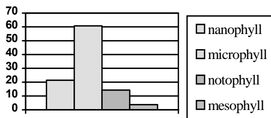
Fig. 2. Leaf size histogram. Badenian flora.

Two facts become obvious: the predominance of the microphyll class, yet in normal limits, and the existence of four size classes. It is a well-balanced histogram from the category of credible.